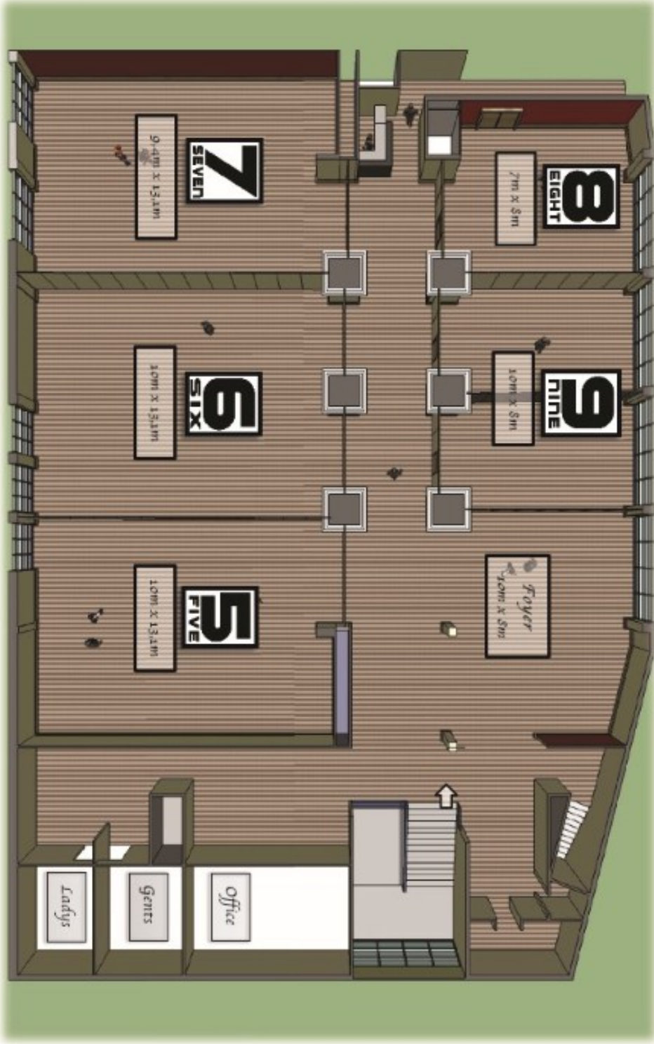
Golden Tulip Brussels – Main function floor